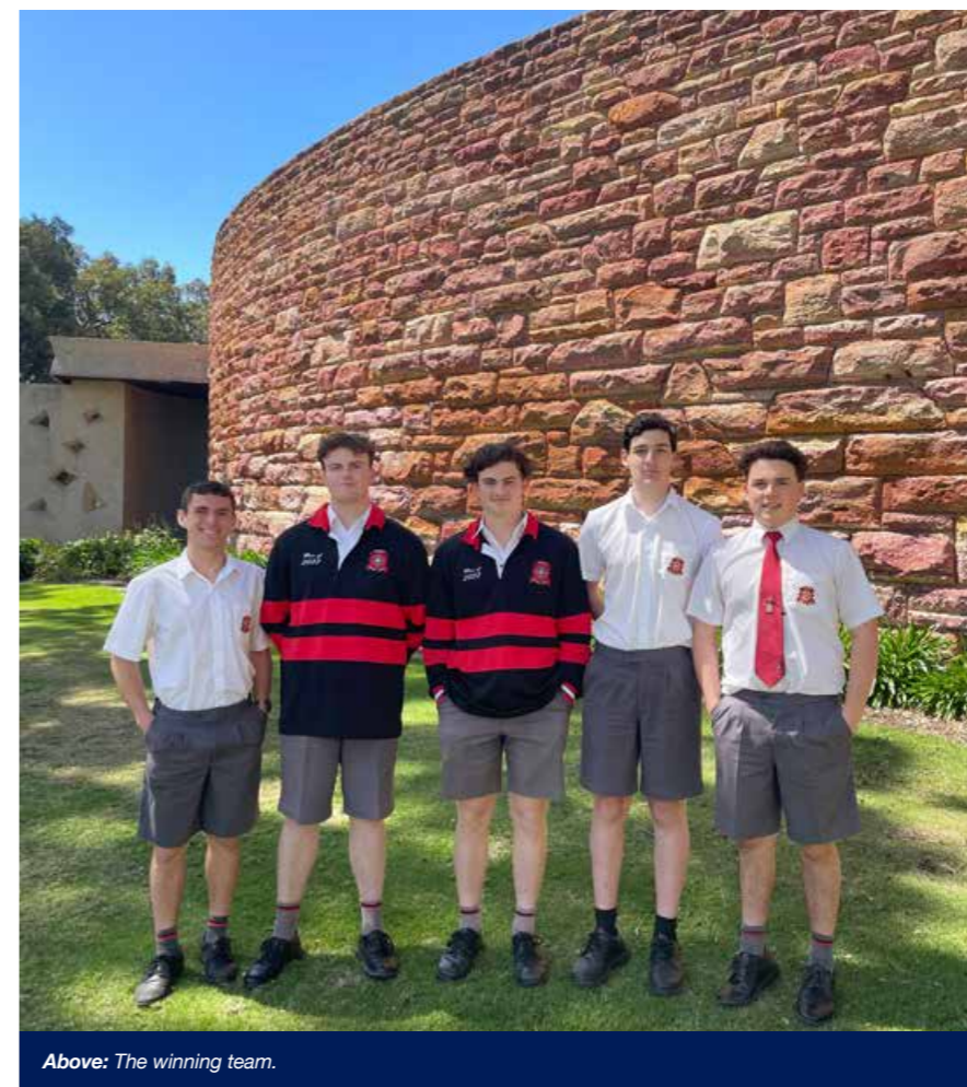
Above: The winning team.

We extend our thanks to the following members of the profession who volunteered as coaches or judges in the 2022 Competition. The programme would not be possible without your support.